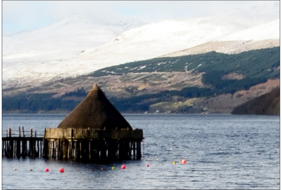
February at the Scottish Crannog Centre along Loch Tay near Kenmore